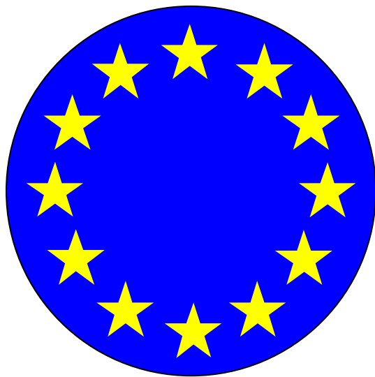
Drawing 1: EU Logo.